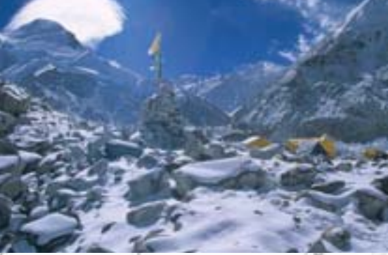
48 days expedition